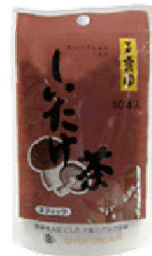
Shiitake mushroom tea stick (Granulated powder)

Standard List Price : ¥ 588 (Without sales TAX : ¥ 560) Total Volume : 2g X 14 Packing size : 67 dia x 102mm Packing Style (Case) : 50 JAN 4901518 550314