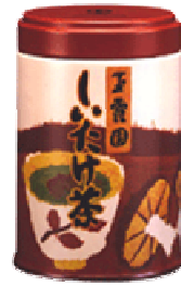
Shiitake mushroom tea in to the can (Granulated powder)

Standard List Price : ¥ 347 (Without sales TAX : ¥ 330) Total Volume : 30g Packing size : 62 dia x 92mm Packing Style (Case) : 5 x 16 JAN 4901518 550369