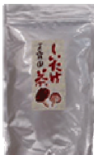
Shiitake mushroom for Business use (Granulated powder)

Standard List Price : ¥ 259 (Without sales TAX : ¥ 247) Total Volume : 2g X 10 Packing size : 98 x 25 x 170mm Packing Style (Case) : 10 X 12 JAN 4901518 550239