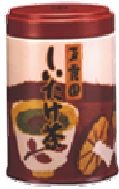
Shiitake mushroom tea in to the can (Granulated powder)

Possible to use it to cook like steamed egg hotchpotch and the traditional Japanese soup, etc.